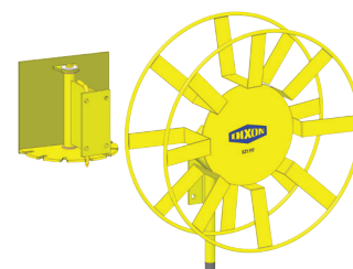
Optional swivel attachment