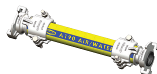
Yellow Minsup™ assembly with claw clamps