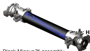
Black Minsup™ assembly with claw clamps