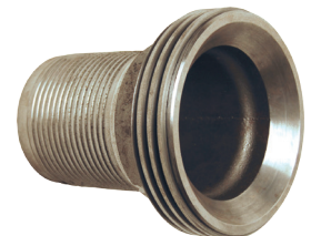
3" and 4"