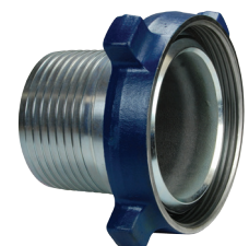
HUM206600CS & HUM206800CS