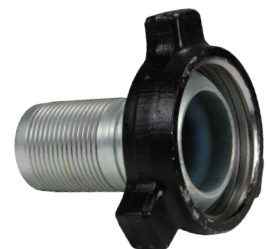
HUM206300CS & HUM206400CS