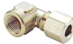
Female Elbow 170C Reference SAE 060203 BA