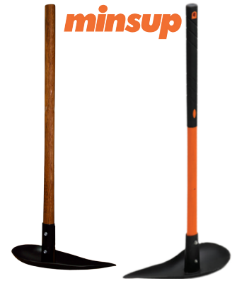
Wooden handle High visibility (orange), shockproof handle