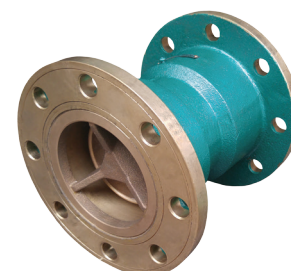
Flanged Table E