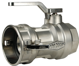
3" Coupler x Female NPT