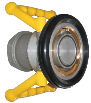
Female Thread x Coupler