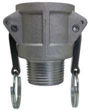
aluminum die cast