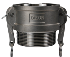
316 stainless steel